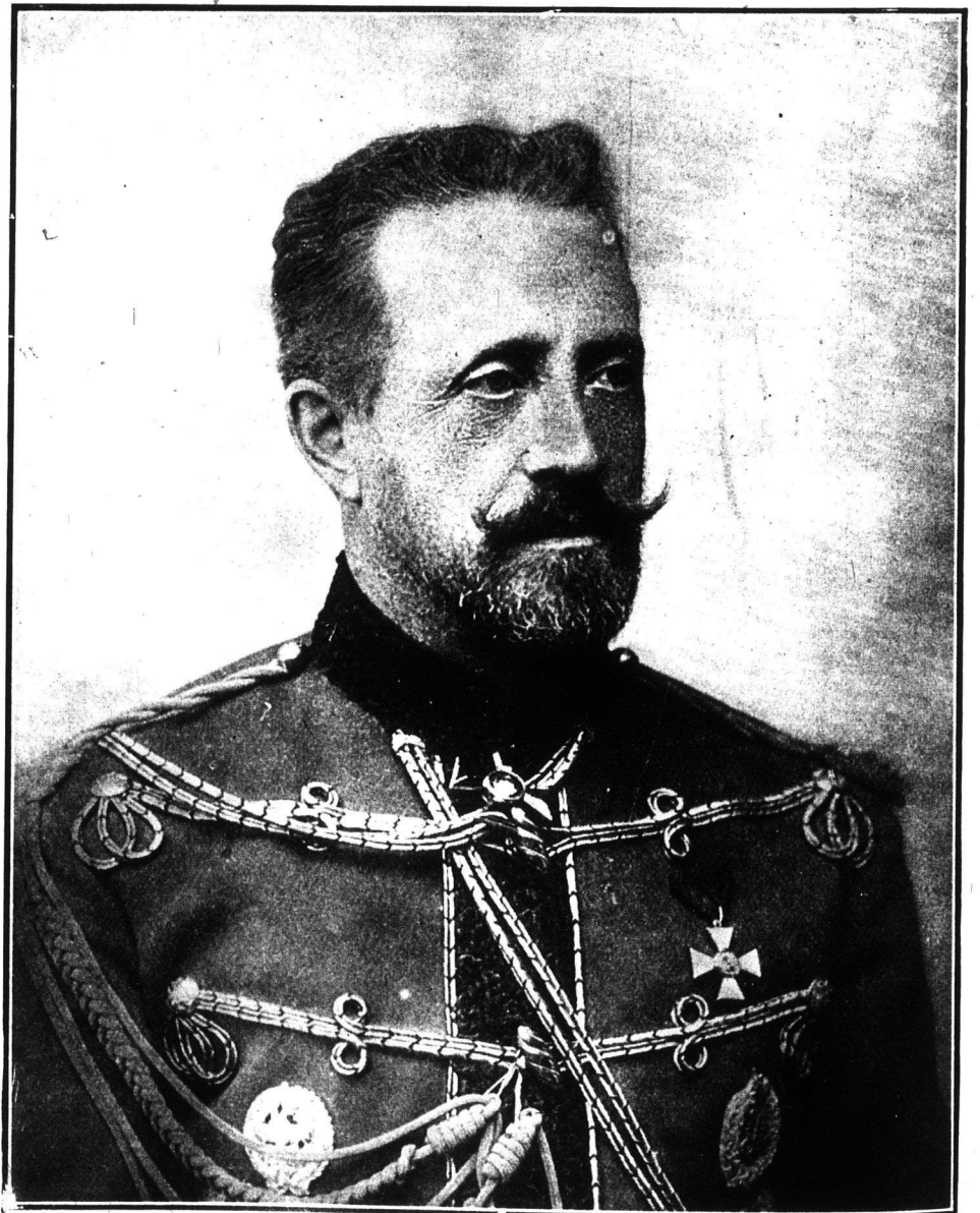
Grand Duke Nicolai Nikolayewitch, Chief Aide to the Czar