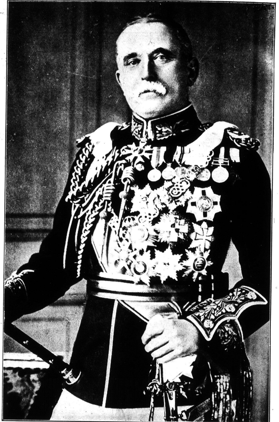
Sir John French, the beloved leader of the British Expeditionary Forces