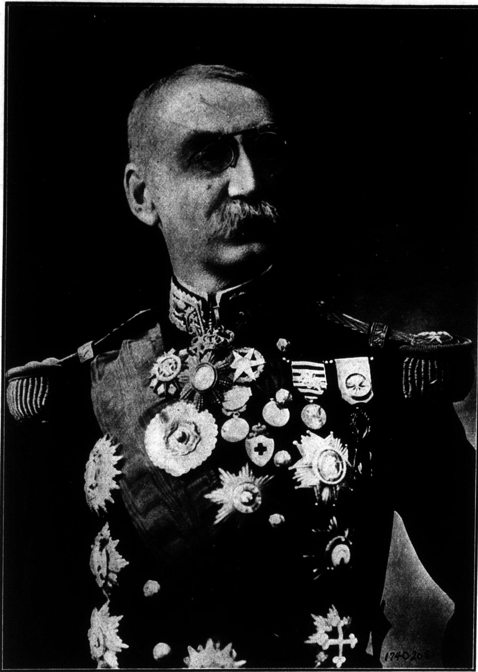
Governor Gallieni, Commander of the Defences of Paris