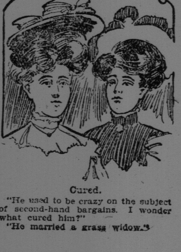
Cured. "He used to be crazy on the subject of second-hand bargains. I wonder what cured him?" "He married a brass widow."