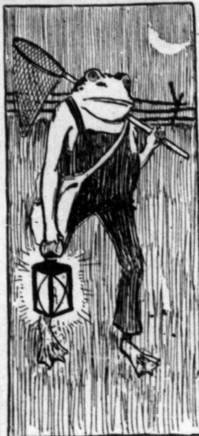
THE TOAD AS A FARMER.

The United States department of agriculture states that from the earliest times the toad has been associated in the popular mind with vague and ludicrous fancies as to its venomous qualities, such as "that touching toads will produce warts on the hands; that killing toads will produce bloody milk in cows; that a toad's breath will cause convulsions in children; that a toad in a newly dug well will insure a