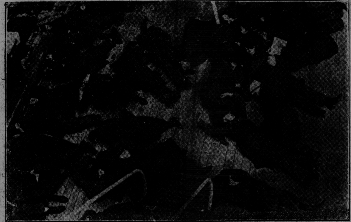
ON THE TROOPSHIP MEGANTIC.

How the gallant Queen's Own of Toronto were laid out about the decks under the grueling fire of General Mal de Mer. For a good many of the boys it was the first experience of salt water sailing.