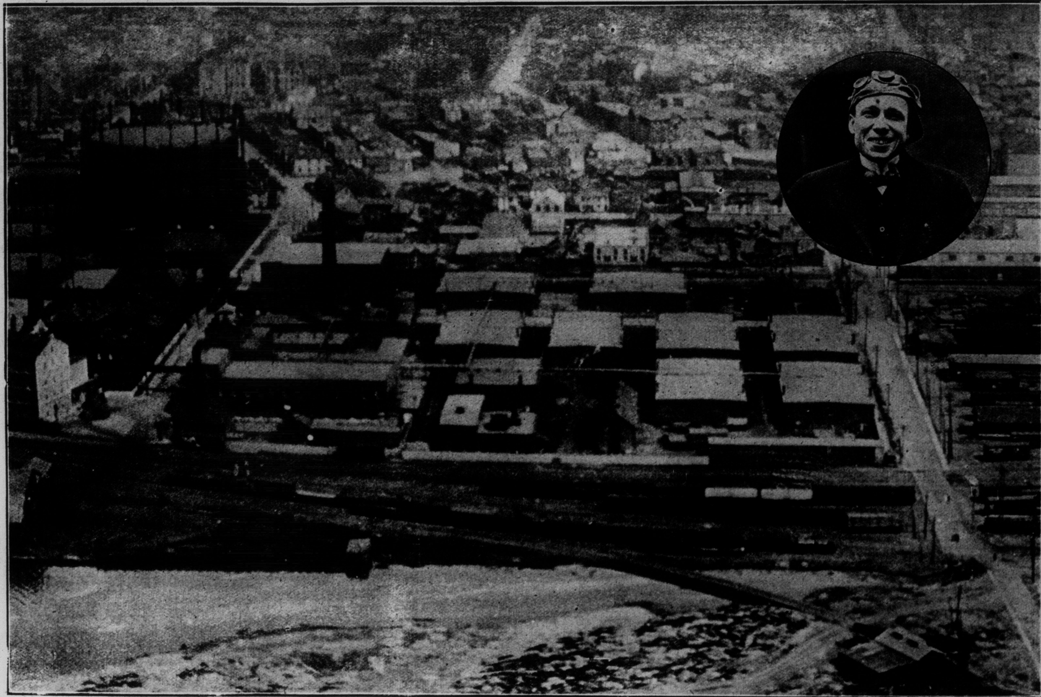
A FILMY VEIL OF SMOKE HUNG OVER THE INDUSTRIAL SECTION AT THE EAST END OF THE BAY AND MADE THE OUTLINES OF THE BUILDINGS VAGUE. THE PHOTO SHOWS CHERRY STREET, KING STREET, PART OF THE GAS COMPANY PLANT ON ONE SIDE AND THE C.N.R. YARDS ON THE OTHER. THE INSET SHOWS THE EDITOR OF THE SUNDAY WORLD, SNAPPED AS THE FLYING BOAT MOVED SLOWLY FROM ITS HANGAR ON THE WESTERN SANDBAR.