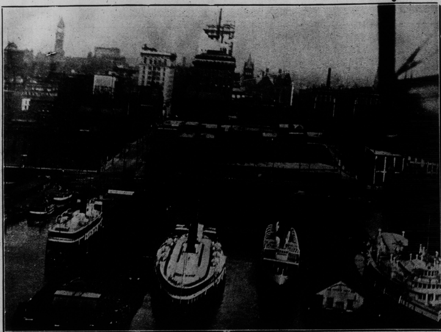
THE FUNNELS ON THE STEAMERS INTERESTED THE PASSENGER WHEN THE FLYING BOAT UNEXPECTEDLY SWOOPED DOWN OVER THE FOOT OF YONGE STREET.