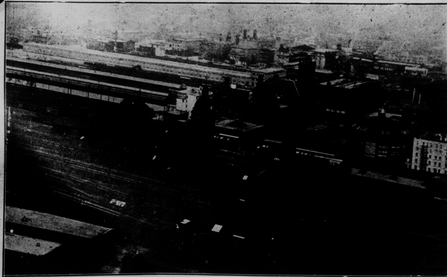
A SILENT HORDE OF TRAINS AND SMOKE-BLACKENED BUILDINGS WERE CAUGHT BY THE CAMERA AS THE BOAT SWUNG HIGH OVER THE UNION STATION.