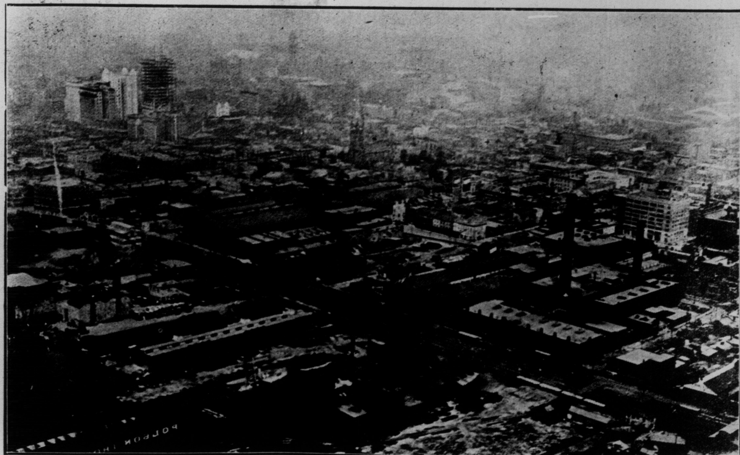
THE SOUTHERN END OF THE BUSINESS SECTION AS IT APPEARS FROM A THOUSAND FEET UP. ST. LAWRENCE MARKET IS IN THE CENTRE OF THE PICTURE AND FROM IT THE LOCATION OF OTHER LANDMARKS CAN BE GAUGED.