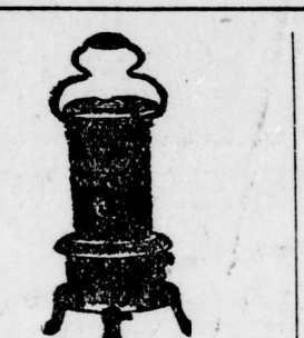
PERFECTION OIL HEATERS. Absolutely no odor