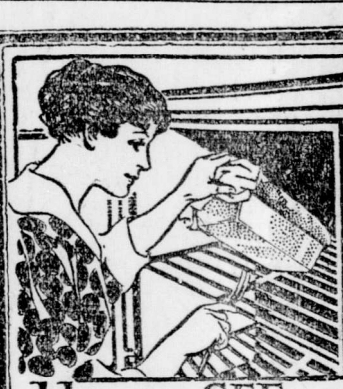
ou can SEE as you Bake

In PYREX food bakes quickly, retains its flavor and you can watch the baking through the dish-the bottom as well as the top. PYREX is sanitary, washes easily, keeps clean, never ages, and is guaranteed not to break