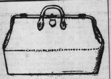
Gentlemen's Double Handle Club Bag, solid leather, fine English hand-stitched frame, choice of black, brown and russet, 10.00 extra good value at.....

With Christmas only three weeks away, you haven't a moment to lose. We've made unusual preparations for a brisk holiday trade, and are ready with the best values we ever had. If you want to be sure of your present, be sure of your store. This list is merely suggestive. Hundreds of other lines equally attractive.