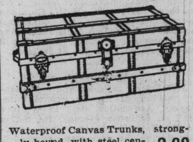
ly bound, with steel cen-tre bands, upwards from...3.00