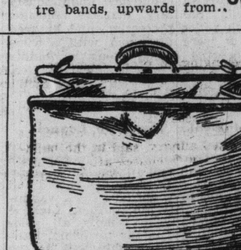
English Kit Bags, solid leather