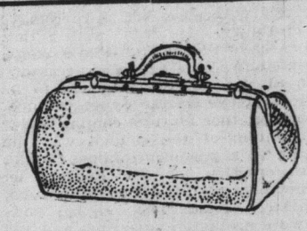
Grain Leather Club Bags, leather lined, fine lock and handle, leather-covered frame, one of our most popular sellers,