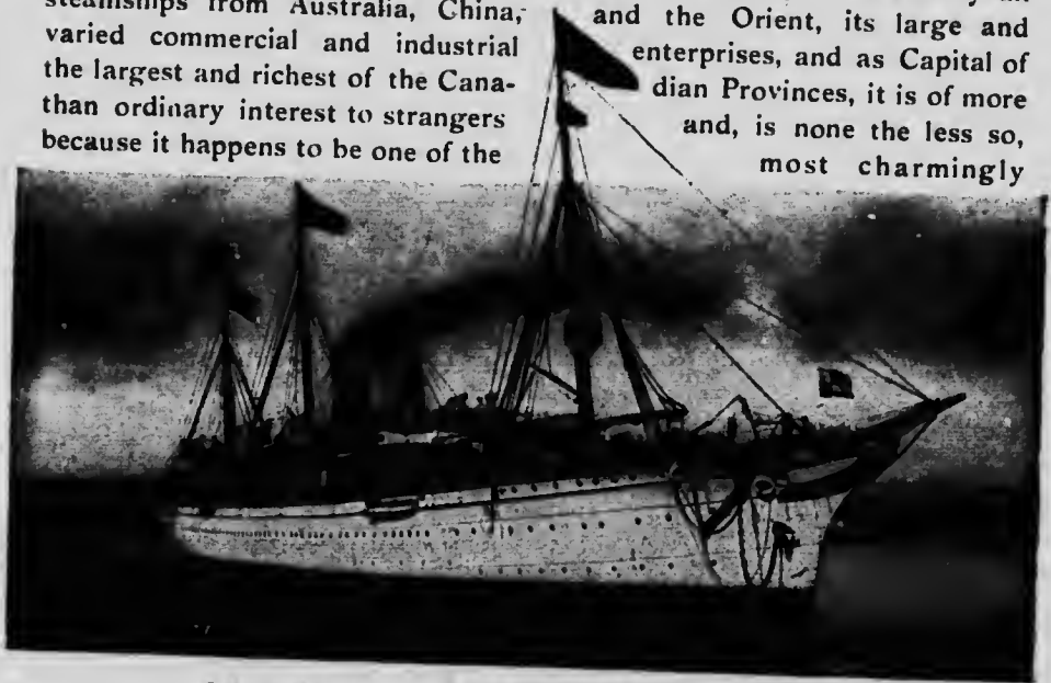
S. S. "Empress of Japan" arriving in Victoria Harbour from China.

Important as Victoria is to the Empire, and to Canada, because of its naval and military strength, its position as the first port entered by all steamships from Australia, China, and the Orient, its large and varied commercial and industrial enterprises, and as Capital of the largest and richest of the Canadian Provinces, it is of more than ordinary interest to strangers and, is none the less so, most charmingly because it happens to be one of the