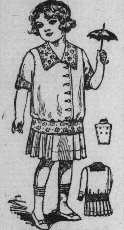
7878 Child's Blouse Dress, 4 to 8 years.

WITH STRAIGHT PLAITED SKIRT, SHORT OR LONG SLEEVES, WITH OR WITHOUT SHIELD.