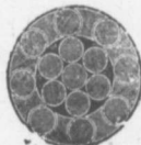
Locked Coil Aerial Cable or Colliery Guide.