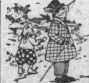
Away they flew

"Dear me," exclaimed the little rabbit, "what a long journey. I should think their wings would grow tired." "Your four little feet would," answered Uncle Lucky. "But wings are strong and seldom tire." And in the next story you shall hear what happened after that.