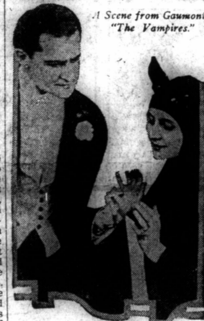
A Scene from Gaumont's "The Vampires."