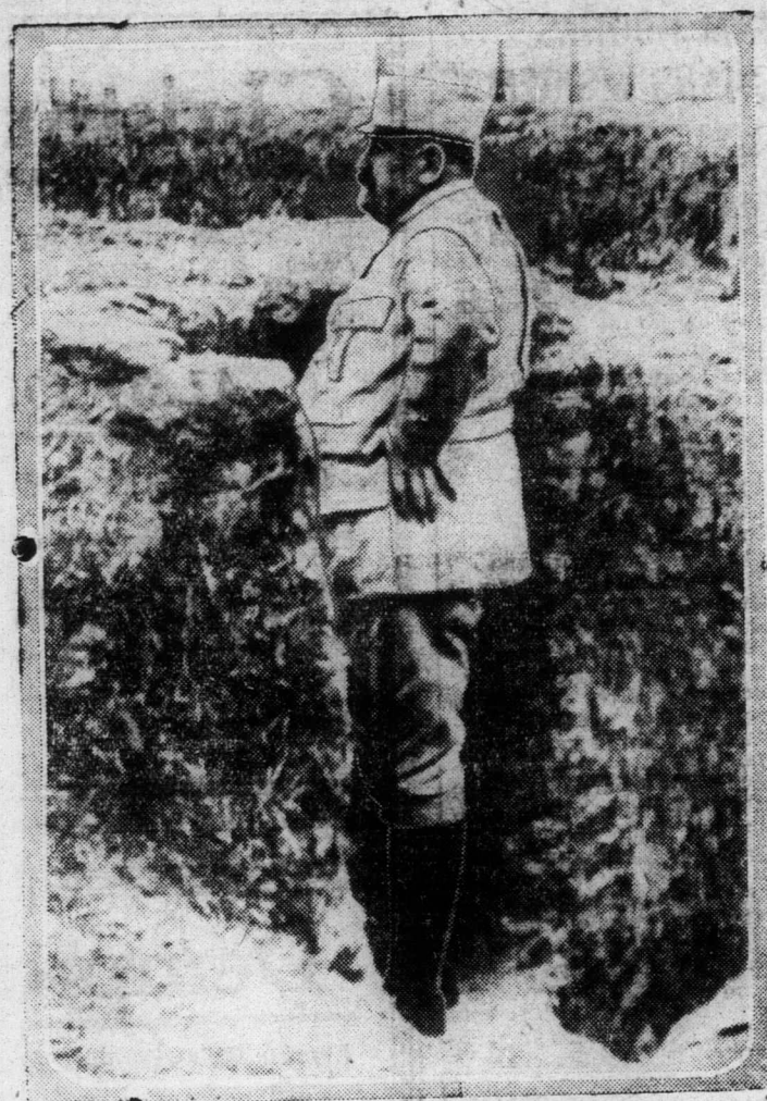
GENERAL BERTHOLET Famous French General, assigned to the Romanian command. To him much credit is due for the recent victories of the Romanians in the Dobruja district, and the successful ejection of the Austrians.

Directions with Every Box of Special Value to Women. Sold Everywhere. 25 boxes, 25 cents.