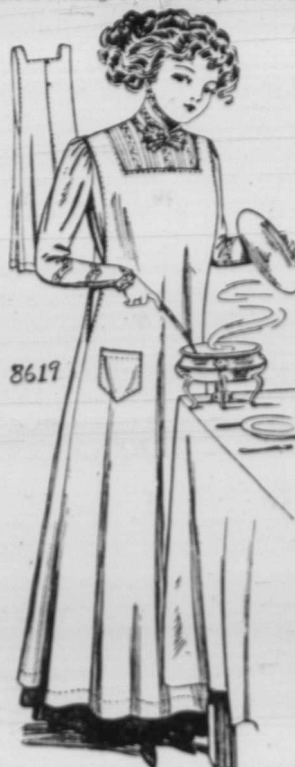
8619. A Practical Kitchen Apron.

Velvet flowers are coming out for the winter, splendid convolvuli in plain or mixed colorings to be worn on velvet hats.