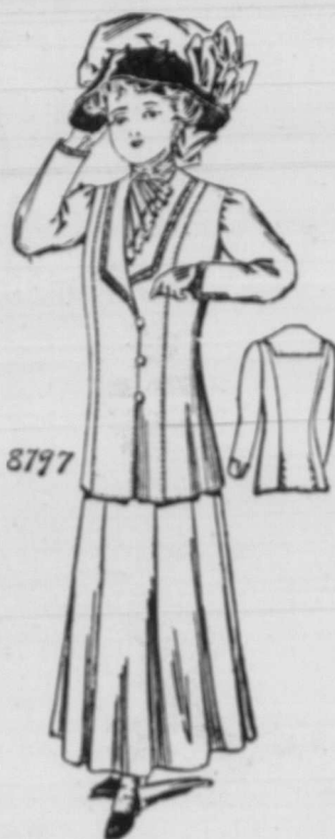
8797. Semi-Fitted Coat for Misses or Small Women.

For skirt trimming nothing is better than wide folds of the same material or satin of the same color used in folds. These are untrimmed.