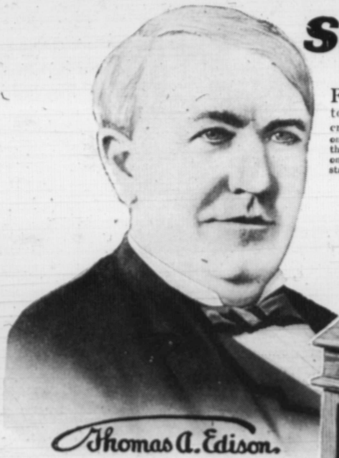
Thomas A. Edison.