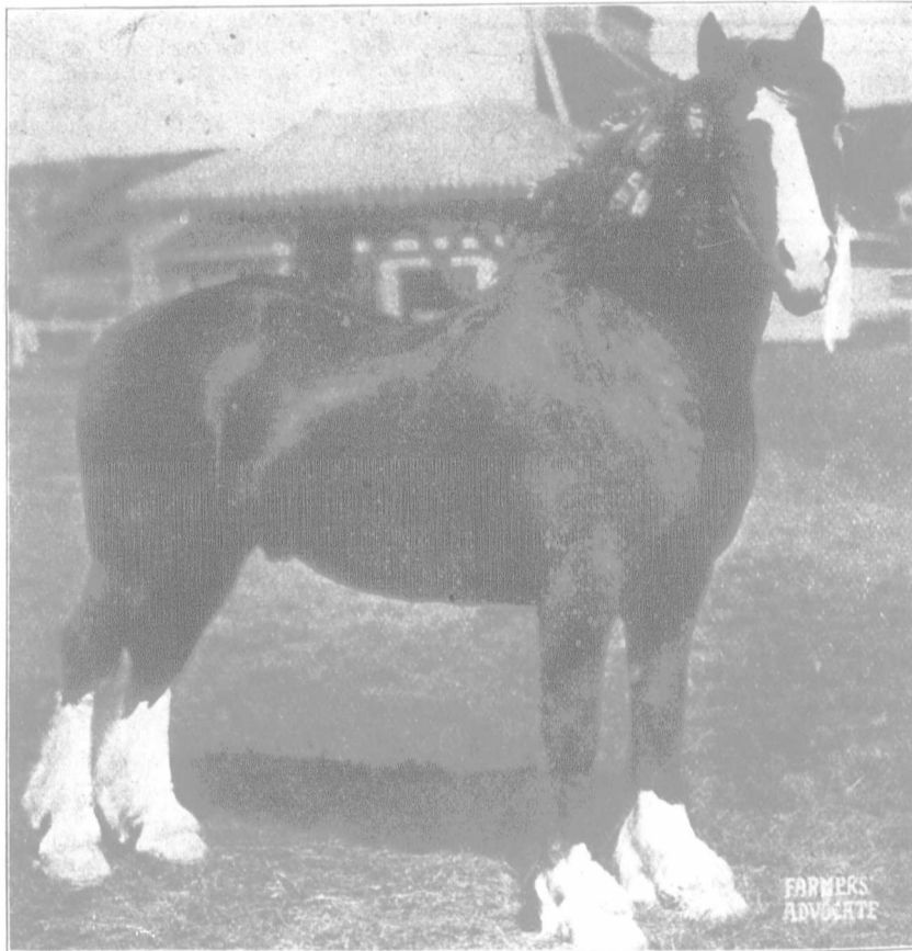
MAIN SPRING. PRIZE THREE-YEAR-OLD CLYDESDALE STALLION AT CALGARY EXHIBITION. OWNED BY DUNCAN CLARK.

Rotations in five or six-year periods appear to offer the best opportunities for increasing crop production, but the three or four-year rotations also give splendid results when the crops are properly arranged. Many combinations of crops are included in the 128 plots now devoted to experiments in crop rotation, giving a splendid basis from which to draw conclusions on good arrangements of crops