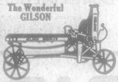
"Goes Like Sixty"

The Wenderful Glison Sile Filler in the one blower that will put the carn over the top of the highest Sile,—and the smallest size will do it with a it h.p. engine. There is a Glison Sile Filler for every purpose,—for the individual farmer,—for the syndicate—and a very large capacity of machine for the jobber. We positively guarantee every Glison Sile Filler to cut and elevate more englise with the same power than any other blower cutter made. With a Glison Cutter you can cut your own corn at just the right time,—no waste—no loss. Be independent of the cutter gang. Refill your sile without expense.