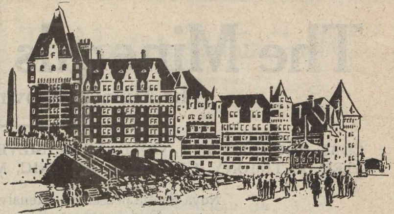
CHATEAU FRONTENAC, QUEBEC.