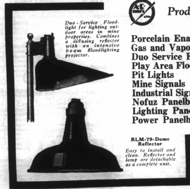
Duo-Service Floodlight for lighting outdoor areas in mine properties. Combines a diffusing reflector with an intensive beam floodlighting projector.

Careful, painstaking study of the varied requirements of the mining industry has resulted in Amalgamated Electric products being specifically designed or readily adaptable to mining application. Installations in the largest mines from coast to coast bear testimony to their merit. The complete line of Benjamin lighting units is sold and manufactured in Canada by Amalgamated Electric Corporation.