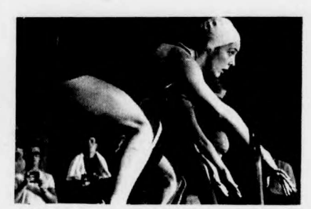
'This is terrible. Now we have to use the pool all the hours that it's open, or they'll close it and let the fish back in.'