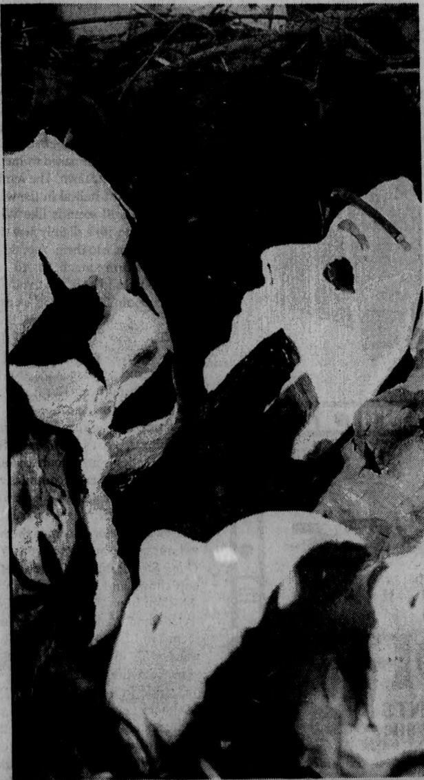
"FROM WOMB TO TOMB": An original piece by students from Shad Valley's first artistic lab seminar, in conjunction with the UNB Art Centre.