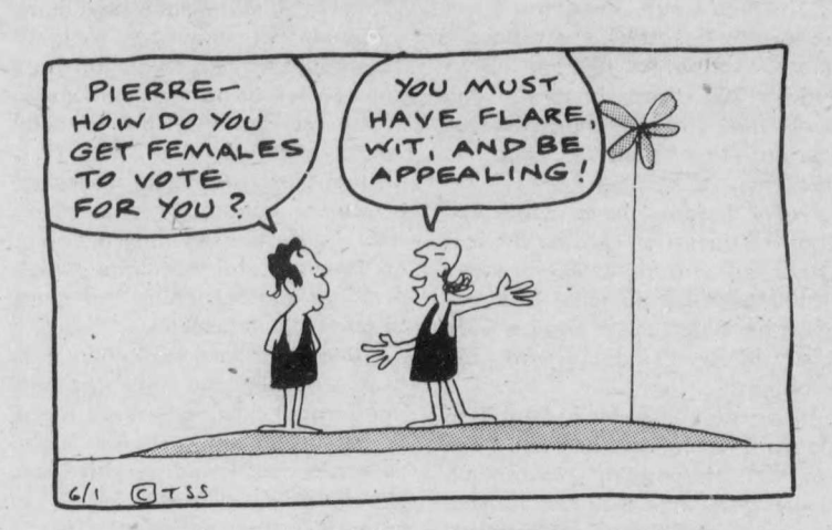
by Ben Wicks