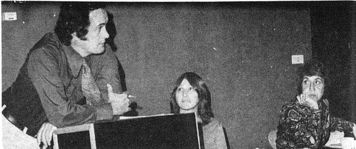
Civil Service Fails to Convince

Further it says, "Canada as one of the richest countries in the world, may acknowledge some obligations" to developing nations, adding that "it would appear more consistent with the highest educational ideals to depend solely on academic (rather than financial or racial) criteria."