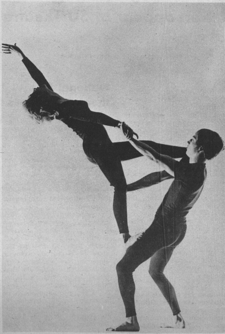
Orchesis Modern Dance Club classes.

This year Orchesis Modern Dance Club offers Senior and Junior classes in modern dance and beginning and intermediate-advanced jazz classes.