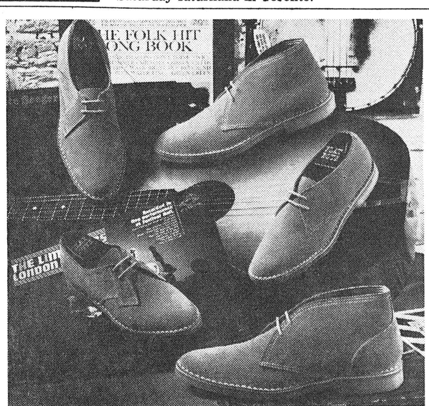
Here are the Village Look PLAYBOYS. All suede. Putty beige. Grey. Faded blue. All styles available in "His" — $9.95. "Hers" — $7.95. ($1 higher west of Winnipeg)

Appointments for interviews are being made at the Student Placement Office. Company and Job information booklets are available there.