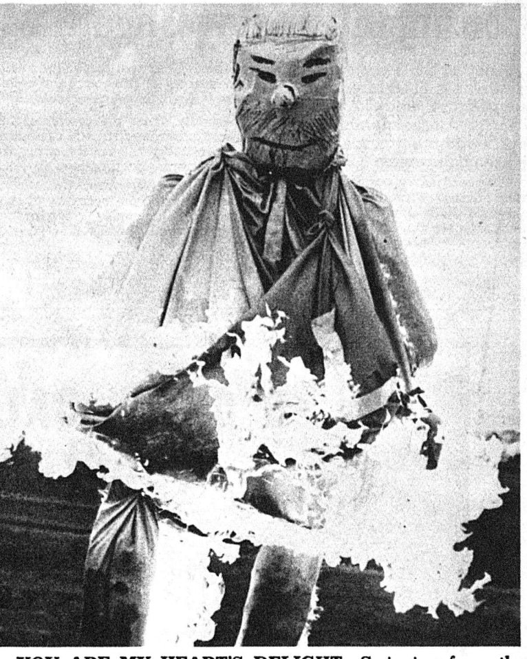
YOU ARE MY HEART'S DELIGHT—Swinging from the goal post during half time at the game Saturday "B.C.," the soul of the Thunderbirds, burns. And Rome fiddled.

THE ANGLICAN UNIVERSITY CHAPLAINCY THE STUDENT CHRISTIAN MOVEMENT