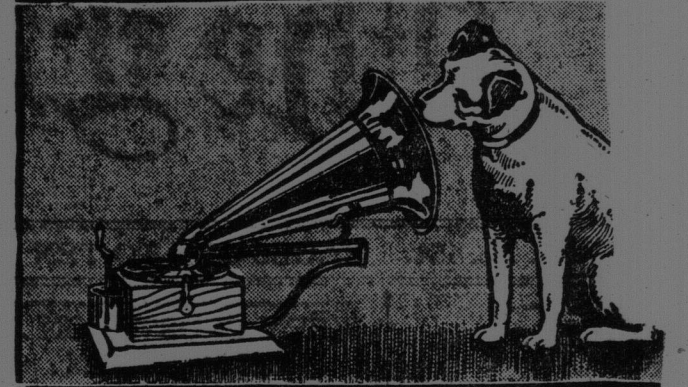
"HIS MASTER'S VOICE" COPYRIGHT, CANADA, 1920, BY EMILE BERLINER