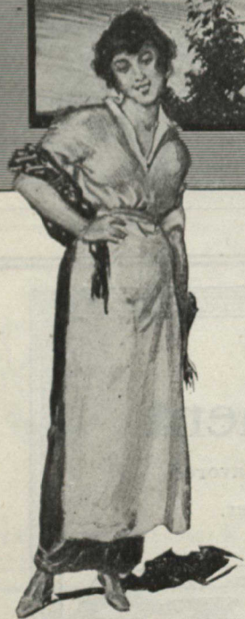
Miss Canada as she appears in picturesque Quebec