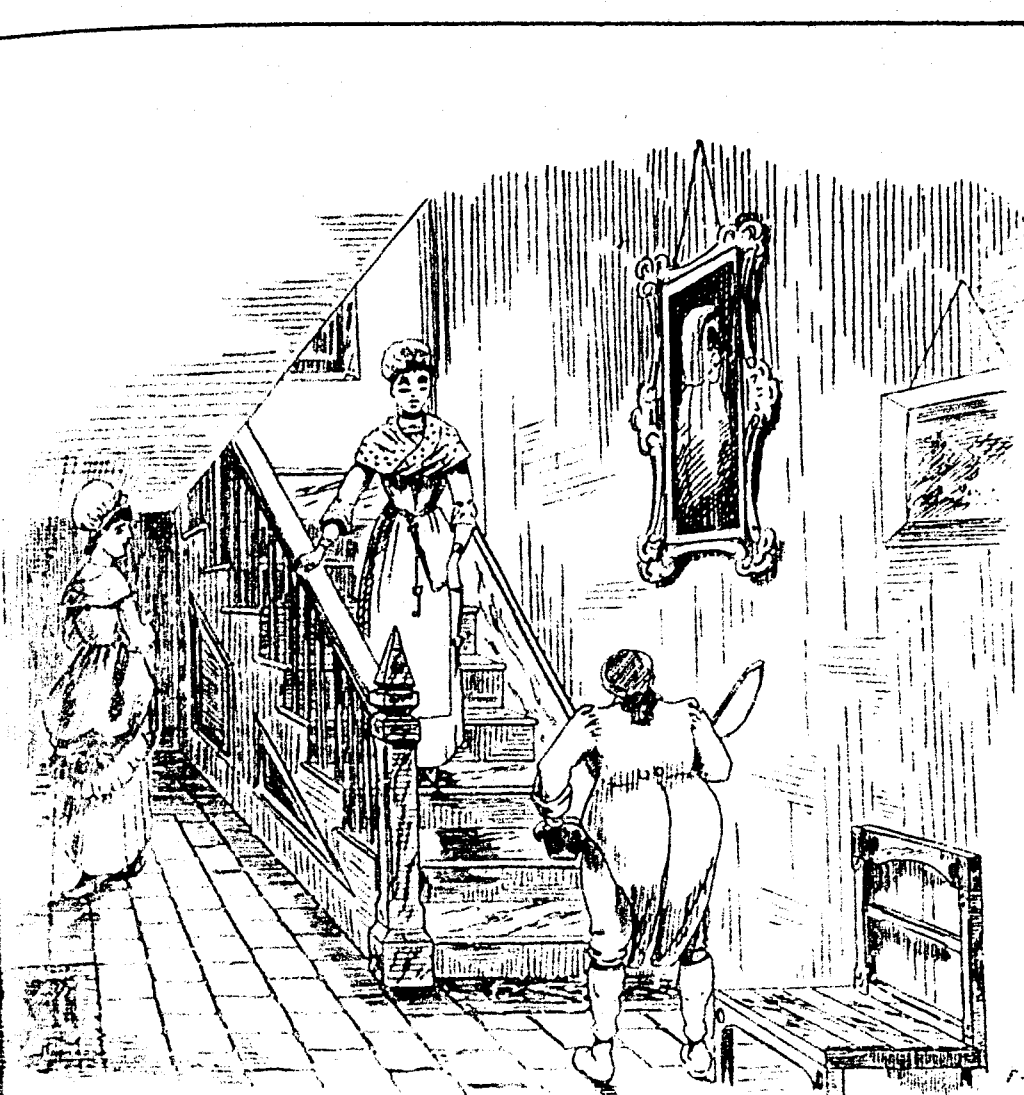
7. Miss Jane came down wi'out delay To hear what Richard he had for to say I do suppose you know, Miss Jane, That I be Richard of Taunton Dene.