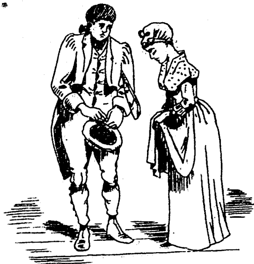
8 I'm an honest man though I be poor And I never was in love before,