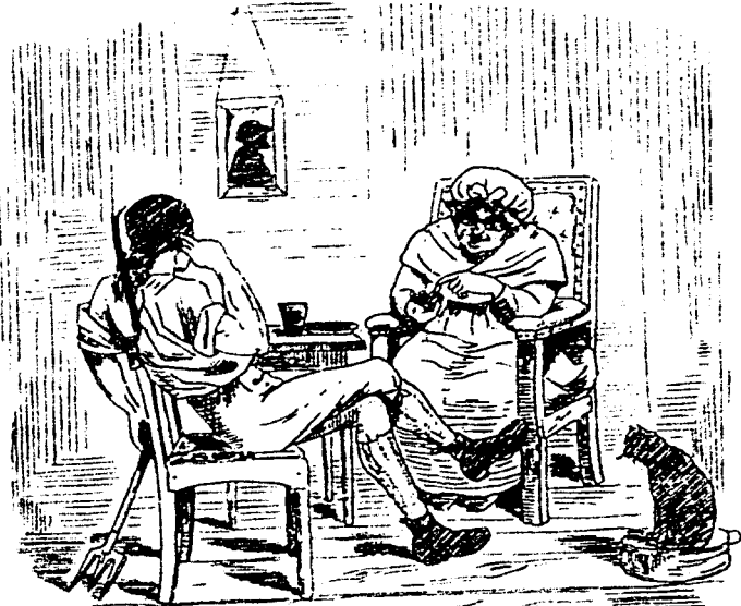
9. And mother has sent me here to woo And I can fancy none but you.