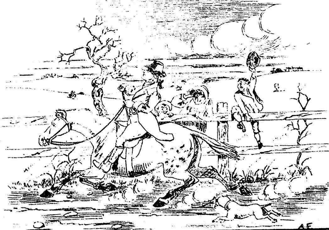
13. Dick's compliments wur so polite They made the company laugh out right, And when he had gotten no more, to say He mounted his Dobbin and gallopped away.