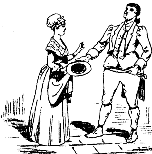
10. And if I consent for to be your bride Pray how for me will you provide? I'll give thee all I yarns I'm sure And what can a man do for'ee more.