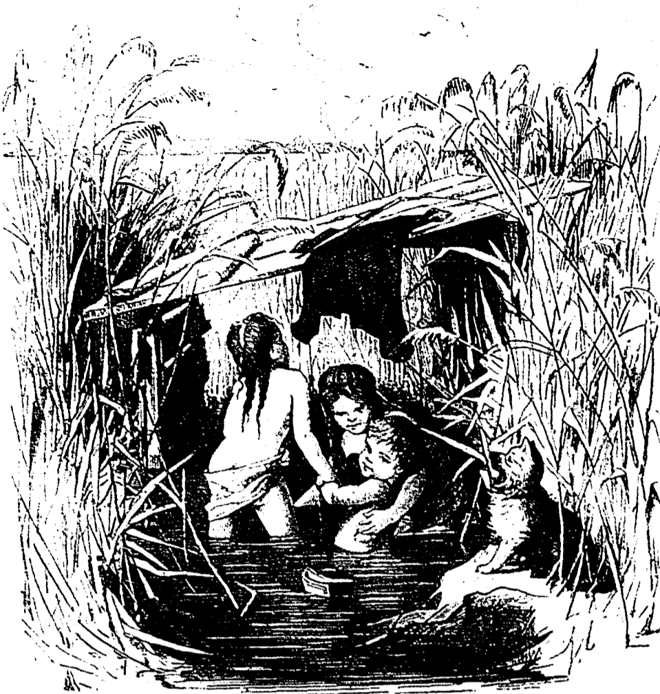
THE CHILDREN'S BATH.