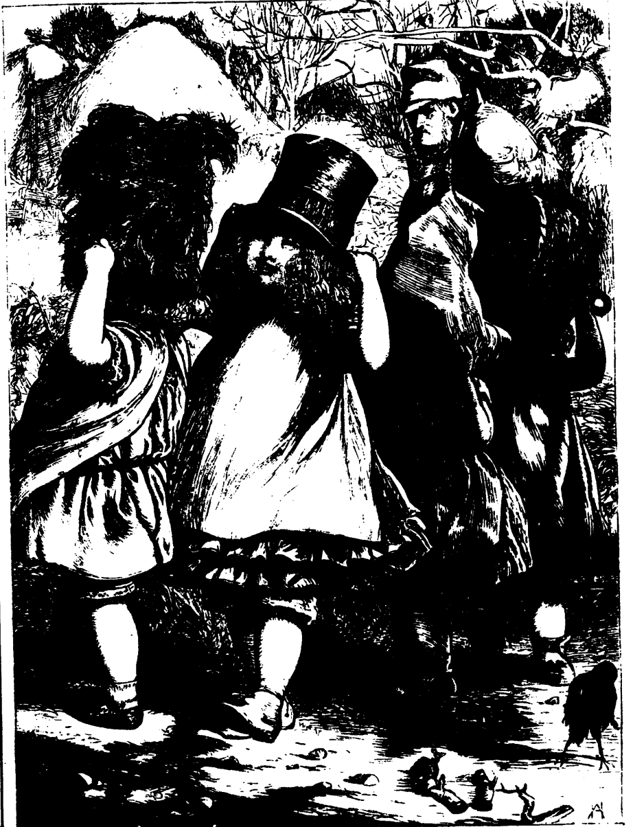
THE BABY BRIGADE.

FIRE-PROOF SAFES, FITTED WITH STEEL DRILL-PROOF DOORS, AND MAPPIN'S UNPICKABLE POWDER-PROOF LOCKS. WILLIAM HOBBS, 4 PLACE D'ARMES. AGENT FOR WHITFIELD & SONS, BIRMINGHAM.