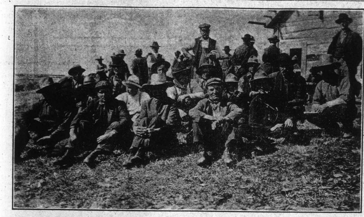
GRANDE PRAIRIE LAND OFFICE -On the first day the new office was opened there was a big rush for homestex.is. The applicants lined up at the front of the office, and when the door was epened the agent gave each man a number, and he then secured the land he desired when his number was called out. From e appearance of the men as shown by the picture it would appear that few, if any, failed to obtain the particular block of land desired.

Agira, Sicily, Sept. 2.-With one suspect under arrest the police ex-pected today to solve the attempted murder of Monsignor Phili Contessa the sacred wine and a moment after