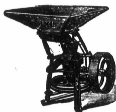
I X L FEED MILLS. The cheapest, most durable and perfect iron feed mill ever invented.