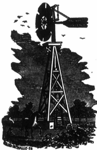
Halladay's Standard Wind Mills. 17 Sizes.

STATE WHAT YOU WANT AND SEND FOR ILLUSTRATED CATALOGUES.