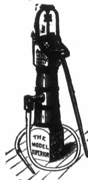
Pumps—Iron & Wood. Force or lift. Deep Geared Wind Mills, for driving Machinery, Pumping Water, &c. From 1 to 40 horse power.