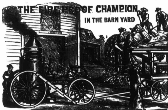
WATEROUS ENGINE WORKS CO., BRANTFORD, CANADA.