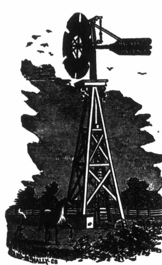
Halladay's Standard Wind Mills.

STATE WHAT YOU WANT AND SEND FOR ILLUSTRATED CATALOGUES.