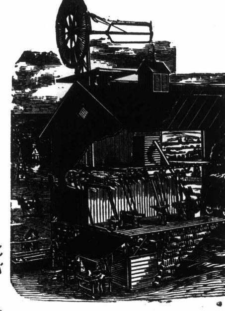
Pumps—Iron & Wood. Force or lift. Deep Geared Wind Mills, for driving Machinery, Pumpin well pumps a specialty Water, &c. From 1 to 40 horse power.