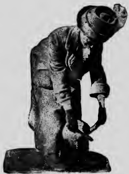
Even a woman can perform the operation of docking successfully.

A few extracts from letters follow. These will serve to illustrate the viewpoint of packers, drovers and live stock commission agents with respect to the castration of ram lambs sold for slaughter.