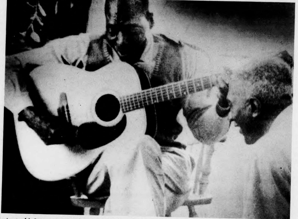
Two inmates of the Bridgewater State Hospital for the Criminally Insane share a moment of musical appreciation in Frederick Wiseman's brilliant documentary Titicut Follies. The film's depiction of the humiliating treatment of inmates — one can hardly call them patients — of the facility was forbidden from being shown anywhere in the world for 25 years by the Massachusets Supreme Judicial Court.

The film is named after an annual show put on by staff and inmates at the institution (Titicut is a native name for the area). Titicut Follies starts with a rendition of "Strike Up the Band" by a half dozen drugged inmates who have difficulty keeping time and re-