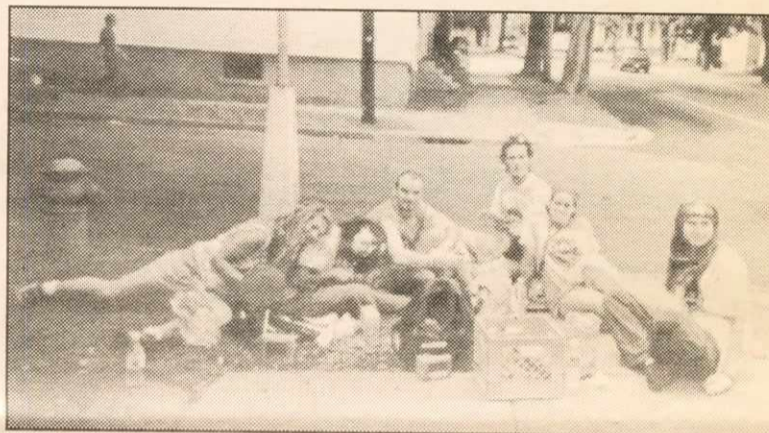
Froshoids piled on curbside: After a few days, return any leftover piles to Dal for safe disposal.

We had lots of fun and by 4:30 p.m. we were all tired and quite sunburned, so we caught the bus back to campus. Shinerama was definitely a frosh experience I'll remember.