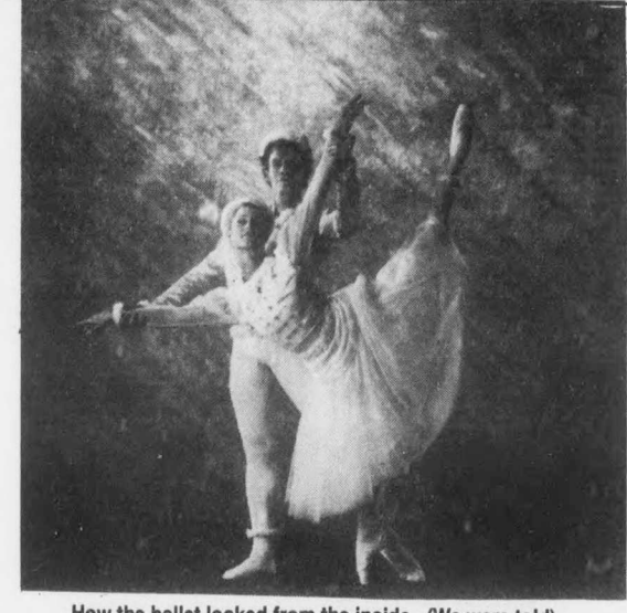
How the ballet looked from the inside. (We were told)

The Telecrap Urinal entertainment staff are anticipating the next Bread 'N Crack Revue; it's slightly more entertaining than the Saint John Council sessions.