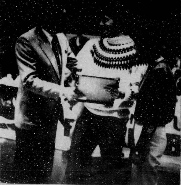
No. 20, getting his well deserved award.