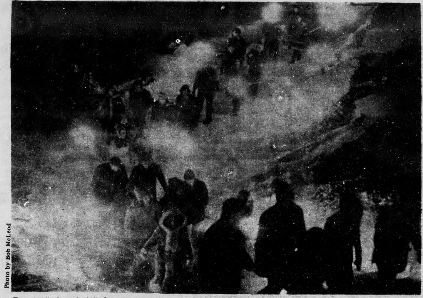
Traipsing back up the hill after a sweet hockey victory over STU, UNBers participated in the traditional Carnival torchlight parade.

The parade will move out from the TC field, proceed through the university to the front gates, along university Avenue to Charlotte Street, from