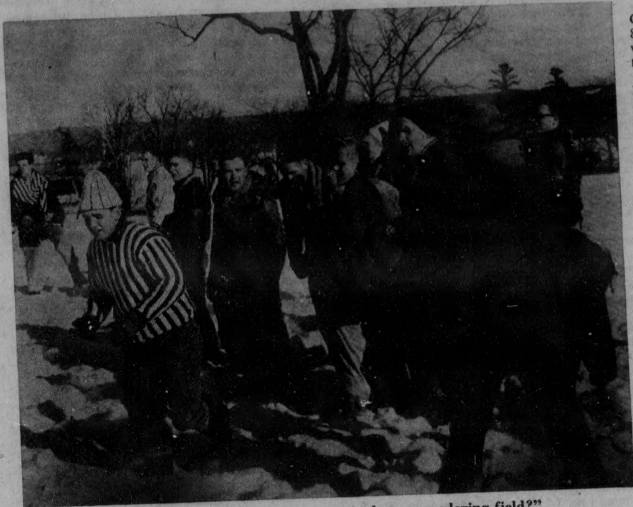
"Hey, you're not serious—an ice castle on our playing field?"