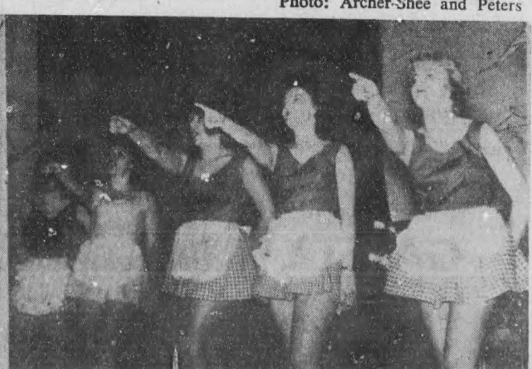
THREE QUEENS PLUS A PAIR MAKES A FULL HOUSE