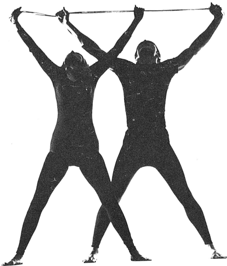
IT'S ED ALLEN TIME