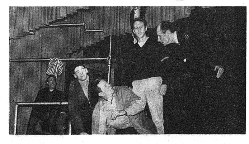
by Archibald MacLeish

The play is an answer to critics who say the Old Testament has no siginifance for the modern world. J.B.'s sufferings are modern rather