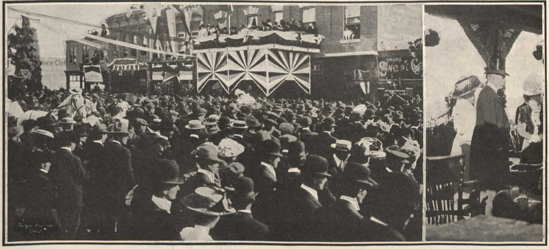
On Oct. 2nd, Mayor Lee, of Edmonton, in the presence of thousands on Jasper Ave., read the Civic Address of Welcome to Their Excellencies Lord and Lady Grey.