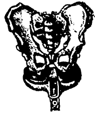
Shows the pelvis as it rests on the Christy Saddle.

MEN'S MODELS. —Two widths, spiral or flat springs, and well padded cushions.