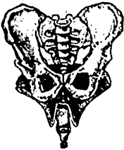
Shows the pelvis as it rests on the ordinary saddle.