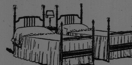
The "Madison" Design 1928 An exquisite example of bed design in the early Colonial manner. Beautifully finished in "hand rubbed" Mahogany and Walnut.

The Simmons Label is your assurance of sleeping equipment built for sleep. All genuine Simmons Beds, Springs and Mattresses have it. No others have.