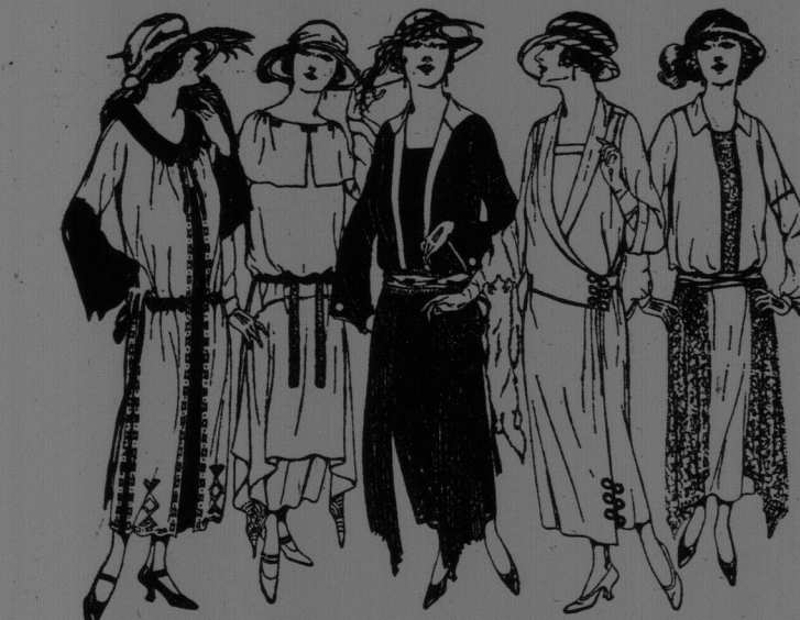
Dress 1203 Dress 1251 Dress 1260 Dress 1248 Dress 1259 35 cents each number

A cargo steamer of 7,500 tons brought 266,000 in March of this year, according to Fairplay. Then the freight market went to pieces, and today the same vessel would not bring more than 262,000. She cost £258,750 in March, 1920, but only $88,000 at the height of the boom in 1912.