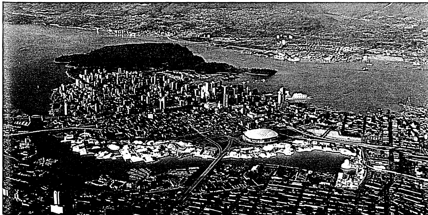
An aerial view of downtown Vancouver showing the two EXPO 86 sites (in white). The main site is along the north shore of False Creek; the second is two kilometers away of Burrard Inlet, where Canada Place is located. The two sites will be connected by Canadian designed A.L.R.T. (advanced light rapid transit) plus by hydrofoil and hovercraft touring around the peninsula.