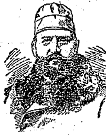
EX-MAYOR DANIEL F. BEATTY.

From a Photograph taken in London, England, 1892.